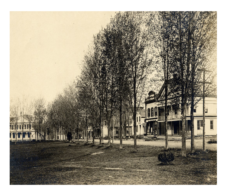
Jefferson Town Green

together online on Sunday, May 16 at 3pm. Contact the historicalsocietyjefferson@ gmail.com to get the Zoom link. Updates will be shown on our Facebook page https://www.facebook.com/The-Jefferson-Historical-Society-309739662479973