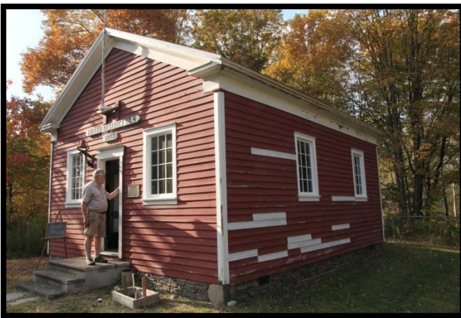
Here our clapboard replacement project is evident on the side of the Fuller District School House. Next summer the building will be scraped and painted.

The schoolhouse will open again in warm weather. Watch for flyers and the sandwich board open sign, or stop by any time you see the door open!