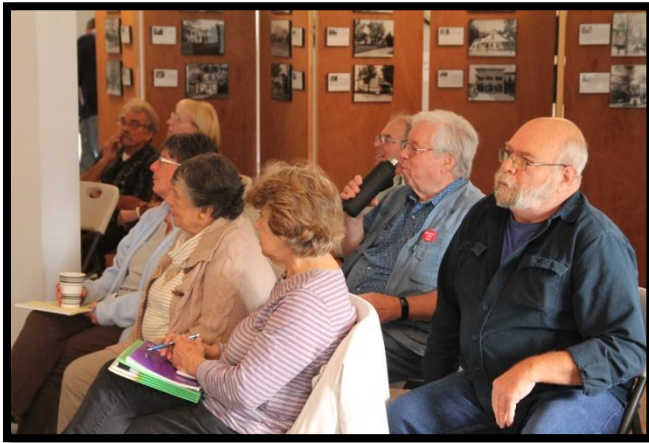
Attendees exchanging ideas at our second meeting of historians and historical societies.