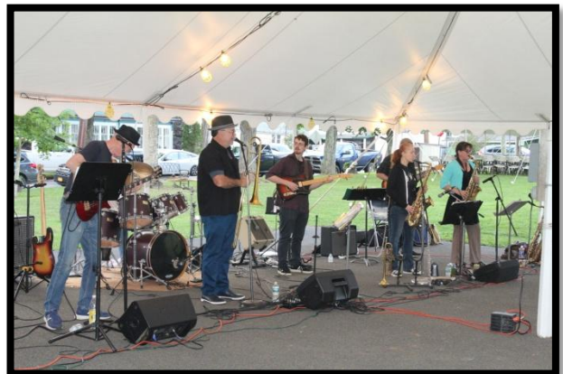
We sponsored the Blues Maneuver for their traditional concert on the Green the night before Heritage Day.