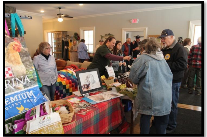
Our holiday market recently in the newly renovated Mill Pond Inn.