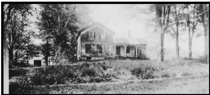
The Skidmore home along Clapper Hollow Road within what is now the Clapper Hollow State Forest.