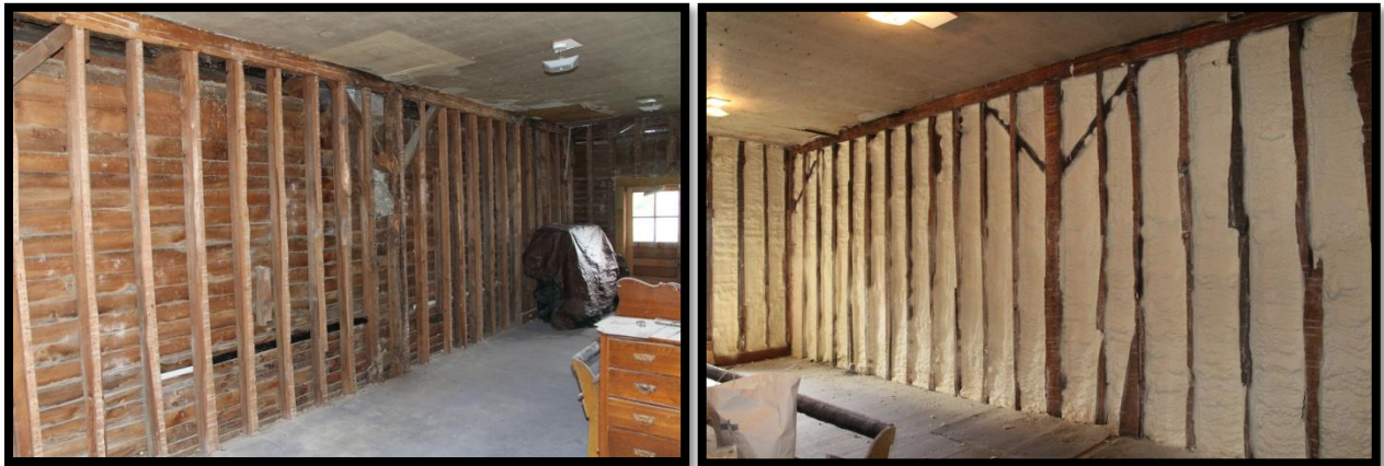
These photos show the second floor of Judd Hall where Eagle Scout candidate Eric Parker led a team removing the walls and ceiling tiles. The left photo shows the room before spray foam insulation was added while the right photo shows that process completed.

We purchased Judd Hall in December 2017. Accomplishments there this year were repairs and painting of the entire exterior and replacement of damaged window panes. Eagle Scout candidate Eric Parker and his work team gutted the second floor of the building removing paneling, plaster and lath walls, and ceiling tiles. Our JHS work teams sealed gaps between the clapboards in preparation for spray foam insulation that was applied to all the second floor walls. Recently walls were framed in that area for our planned office/archive room. Behind the building six large trees growing too close to the foundation were cut down and their roots removed. A section of the foundation on the north wall was cracked and had shifted in position. That area was removed and the foundation was replaced. While the area was dug up, we replaced the septic tank. Additional work was also done around some of the building sill and a heating duct is being added to the kitchen. Contractors have been lined up to upgrade the electrical work and apply the sheetrock upstairs so the Sally Swantz Memorial Archive Room and Nicholas Juried Museum of Jefferson History can be developed. Sally was a strong supporter of JHS and was passionate about genealogical research. Engineers have developed plans for the fabrication of the required metal fire escape and we are awaiting bids for that actual construction.