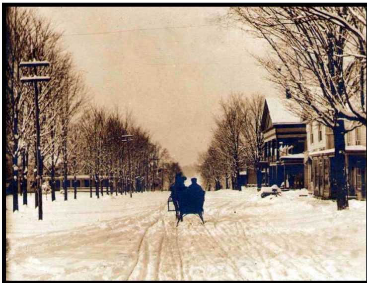
Winter on Jefferson's Main Street over a century ago.