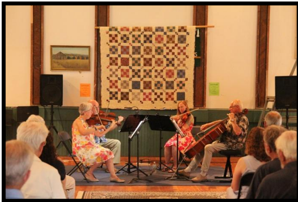
The Upper Catskill String Quartet performing in the Maple Museum.