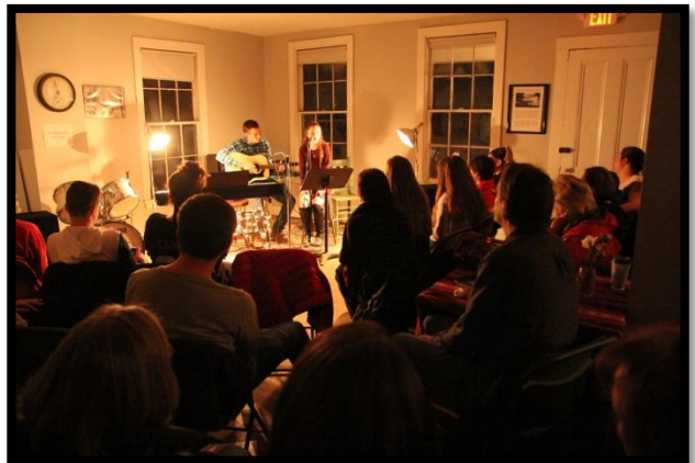
The Jefferson Farmers' Market (left) was an active place to be each Saturday morning for several months. The open mic events in Judd Hall (right) attracted large crowds.