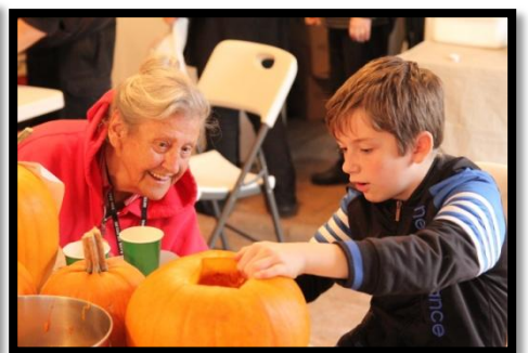
A family enjoying our second annual pumpkin carving at Judd Hall.