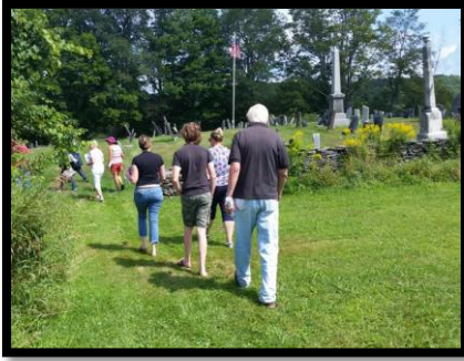
Tour group heading into old Jefferson.