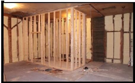
Here the future office/archive room has been framed out.