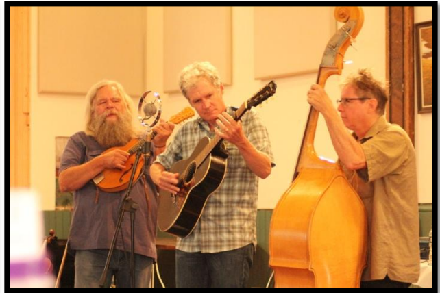
The First Call Brass Ensemble performed from the bandstand built by the Jefferson Cornet Band in 1900. The Canal String Band had the audience tapping their feet to the music in the Maple Museum.