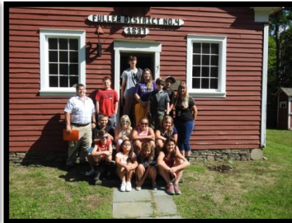
Students from the CROP group on their tour of the Fuller District School House.